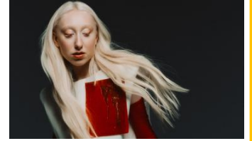
Poland LUNA - The Tower